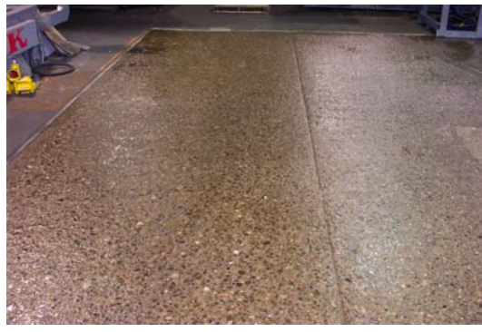
Concrete Sealer, Dustproofers and Hardeners

With our extensive experience in commercial and industrial floor surface restoration, we can repair damaged or worn floors making them better than new utilizing some of these processes: