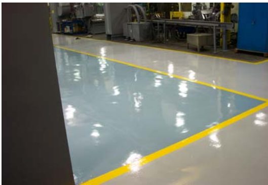
Troweled Floor Resurfacers