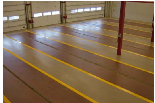
Seamless Quartz Flooring