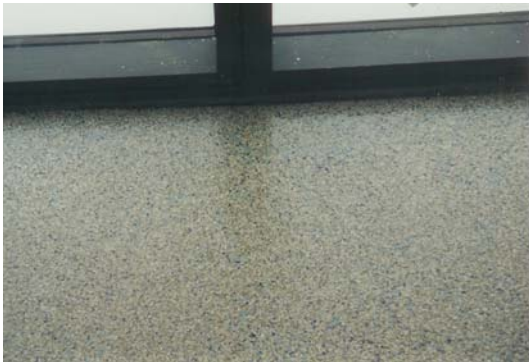
Decorative Flake Flooring