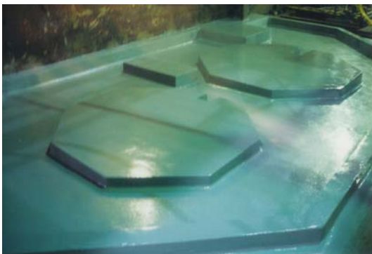
Chemical Resistant Surfaces