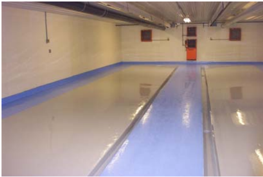
High Performance Coating Systems

Flor-Tec, Inc. has been providing it's customers in northeast Pennsylvania, and the surrounding area, with concrete restoration and protection systems since 1985. We develop customized turnkey solutions designed to meet our customer's specific requirements. At Flor-Tec, we provide many types of flooring solutions starting with professional surface preparation to state of the art polymer technology and professional installation.