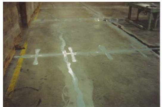
Crack & Joint and Pothole repairs