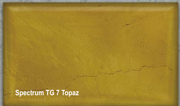
Spectrum TG 7 Topaz