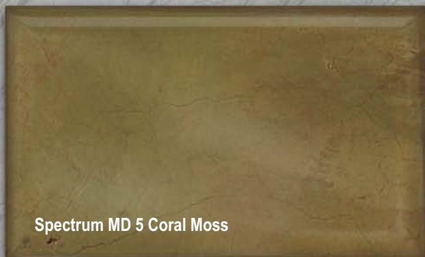
Spectrum MD 5 Coral Moss