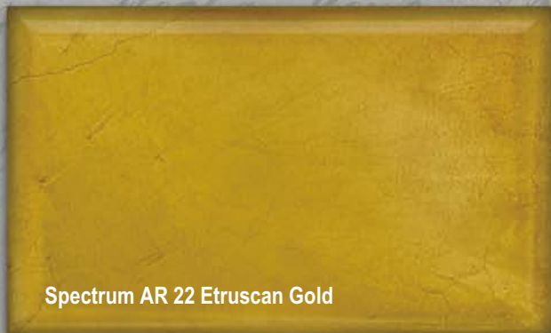
Spectrum AR 22 Etruscan Gold