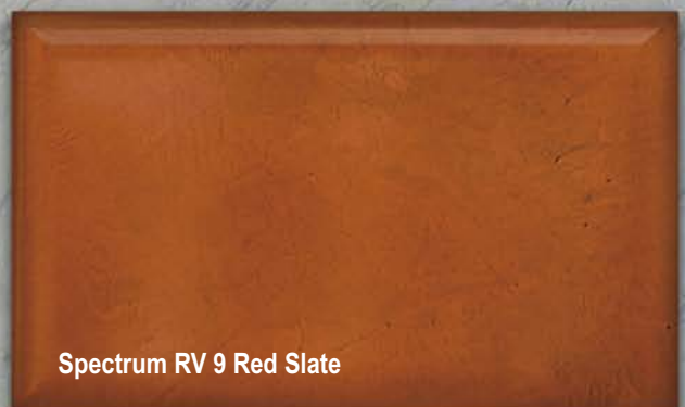
Spectrum RV 9 Red Slate

©2005 All rights reserved. L&M Construction Chemicals, Inc. #LW-05-0203