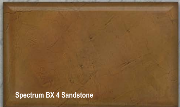
Spectrum BX 4 Sandstone