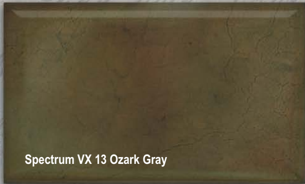
Spectrum VX 13 Ozark Gray