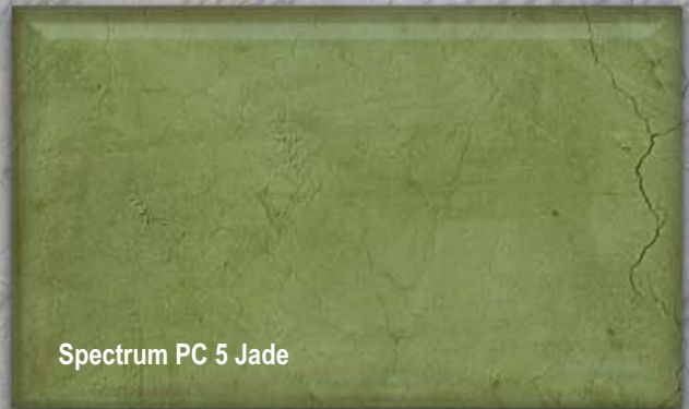
Spectrum PC 5 Jade